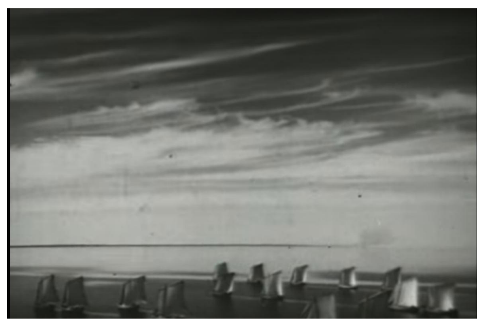
The first scene of Nakhimovtsy's regatta, 0.29.20