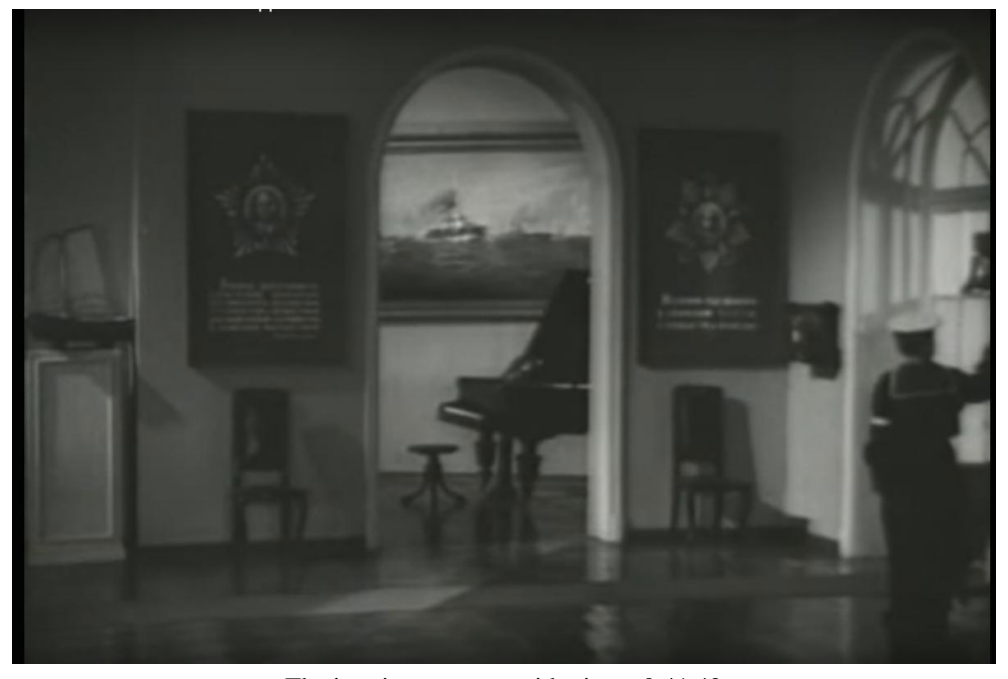
The interior stage set with piano, 0.41.42