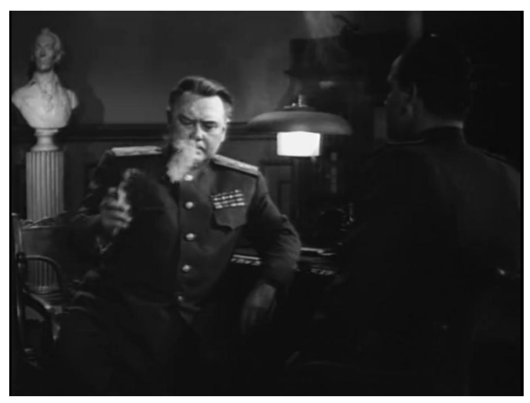
"You should love common people": Soviet general reprimands his son with the Suvorov's bust in the background